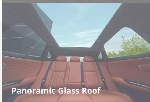
Panoramic Glass Roof