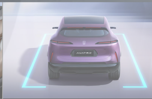
Intelligent Parking Assistance