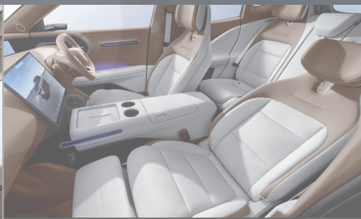
Dual Zero-Gravity Seats