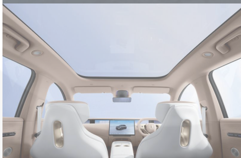
Panoramic Glass Roof with Electric Sunshade