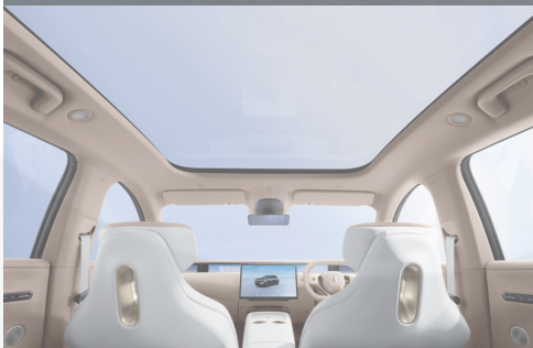
Panoramic Glass Roof with Electric Sunshade

Get the latest price list from Sgcar mart.com