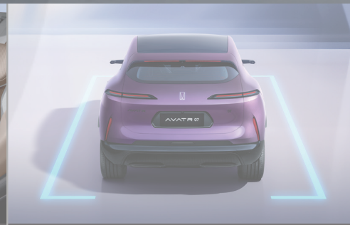
Intelligent Parking Assistance