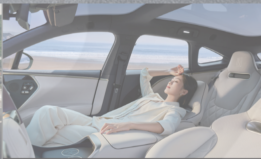
Zero-Gravity Nappa Leather Seats