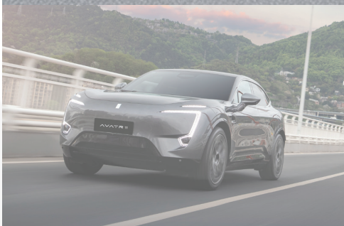
Up to 600km Driving Range