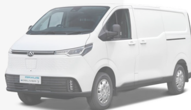
eDeliver 7 N